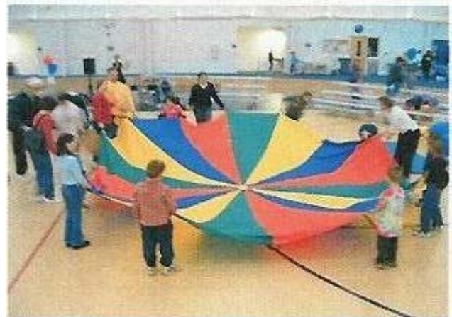
VSA arts of Ohio Twinsburg Arts for All Festival “The Great Artdoors” April 5, 2003