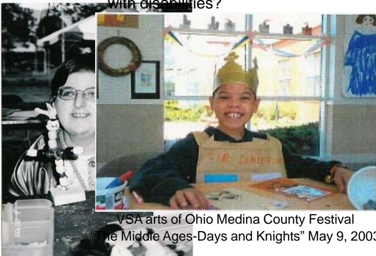
VSA arts of Ohio Medina County Festival “The Middle Ages-Days and Knights” May 9, 2003